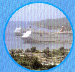
Galaxy Wave to/from La Ceiba

FLOWERS BAY: Every Sunday afternoon you can watch baseball like it used to be played. Undiscovered talents compete in six teams compete for the Island League title and play to a jungle and beach backdrop.